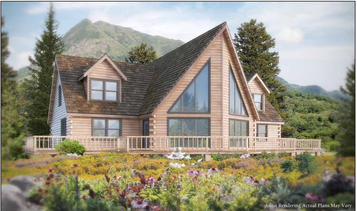
Artist Rendering Actual Plans May Vary